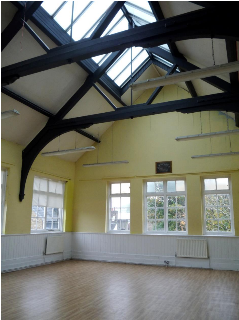
Upper Hocking Hall