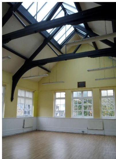
Upper Hocking Hall