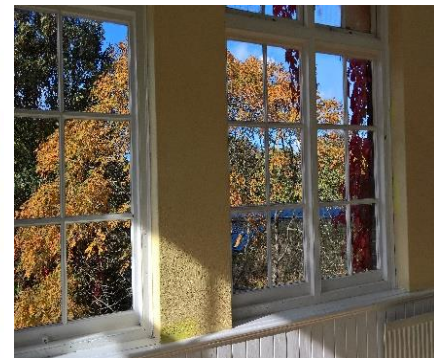
View from Upper Hocking Hall