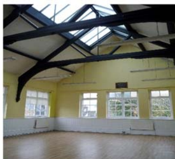
Upper Hocking Hall