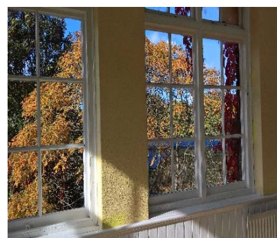
View from Upper Hocking Hall